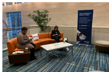
Exhibit Hall Refreshment Sponsor

Capture the eyes of all event attendees as our Exhibit Hall Refreshment Sponsor. Your company will receive signage at the refreshment station, a central location where attendees can treat themselves to water, coffee and light snacks throughout the event. This sponsorship includes 3 complimentary event registrations.