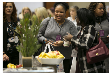
Photo Wall Sponsor

A wall banner with your logo provides the perfect backdrop for impromptu attendee selfies. This sponsorship also includes social media recognition and 3 registrations.