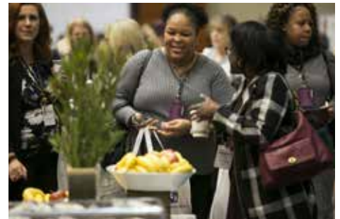
Photo Wall Sponsor

A wall banner with your logo provides the perfect backdrop for impromptu attendee selfies. This sponsorship also includes social media recognition and 3 registrations.