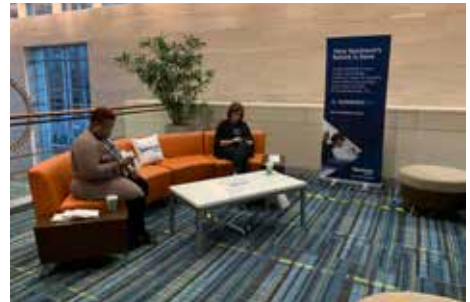
Exhibit Hall Refreshment Sponsor

Capture the eyes of all event attendees as our Exhibit Hall Refreshment Sponsor. Your company will receive signage at the refreshment station, a central location where attendees can treat themselves to water, coffee and light snacks throughout the event. This sponsorship includes 3 complimentary event registrations.