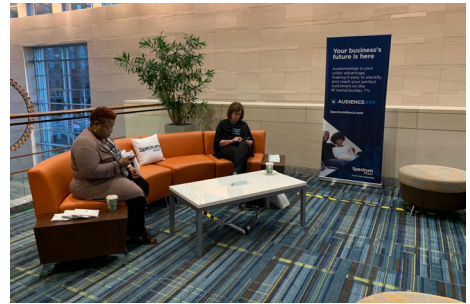
Exhibit Hall Refreshment Sponsor

Capture the eyes of all event attendees as our Exhibit Hall Refreshment Sponsor. Your company will receive signage at the refreshment station, a central location where attendees can treat themselves to water, coffee and light snacks throughout the event. This sponsorship includes 3 complimentary event registrations.