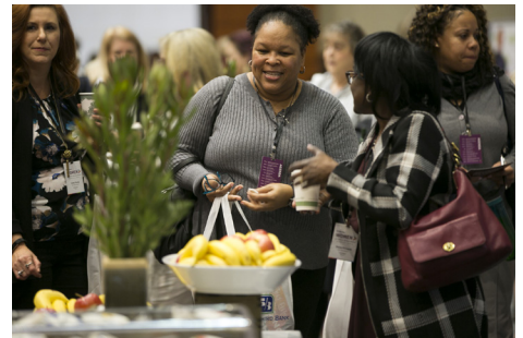
Photo Wall Sponsor

A wall banner with your logo provides the perfect backdrop for impromptu attendee selfies. This sponsorship also includes social media recognition and 3 registrations.