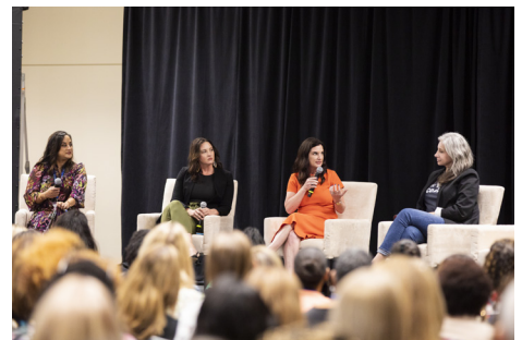
Photo Wall Sponsor

Sponsor signs at room entrance and stage, welcome remarks from sponsor, introduce the panel, slide with logo on stage screen, list of attendees, ROI report, company logo included on event materials (5 seats)