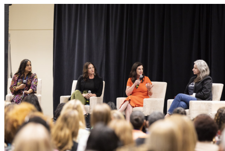
Photo Wall Sponsor

Sponsor signs at room entrance and stage, welcome remarks from sponsor, introduce the panel, slide with logo on stage screen, list of attendees, ROI report, company logo included on event materials (5 seats)