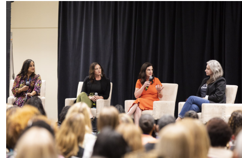
Photo Wall Sponsor

Sponsor signs at room entrance and stage, welcome remarks from sponsor, introduce the panel, slide with logo on stage screen, list of attendees, ROI report, company logo included on event materials (5 seats)